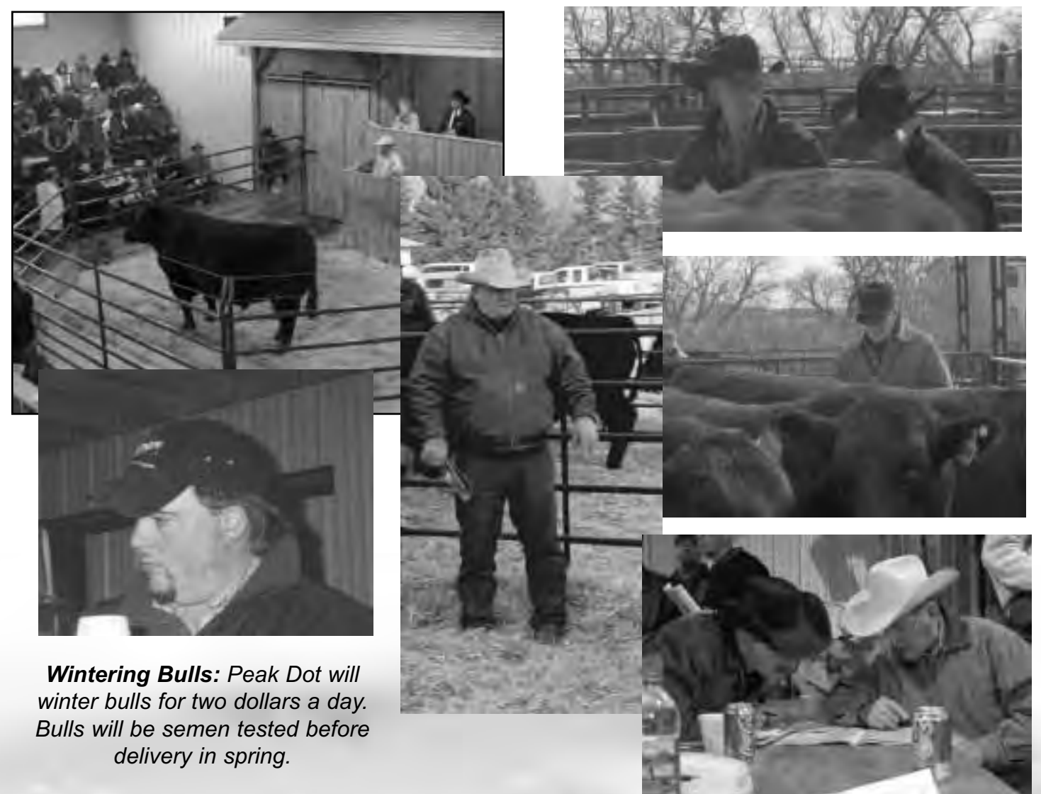
Wintering Bulls: Peak Dot will winter bulls for two dollars a day. Bulls will be semen tested before delivery in spring.