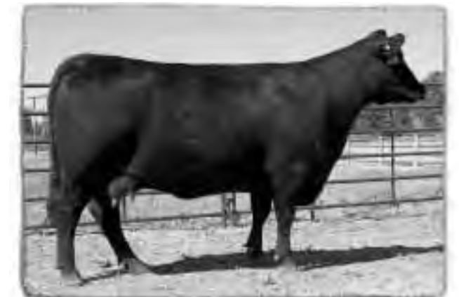
QUEEN OF PEAK DOT 710P Dam of Lot 21

MALE PDAR 131S 1337576 March 14 2006 S A V 8180 TRAVELER 004 SITZ TRAVELER 8180 S A V 004 PREDOMINANT 4438 BOYD FOREVER LADY 8003 S A F 598 BANDO 5175 S A V EMBLYNETTE 1182 S A V EMBLYNETTE 7319 LOMA LANES CRACKER JACK 51 LOMA LANES CRACKER JACK 4F DOUBLE AA ANNIE K 679'01 DURNESS KATHLEEN 1W SHALICA ANNIE K 259 97 DOUBLE AA BANDY 71'95 DOUBLE AA ANNIE K 586'95 BW: 83 lbs. Adj. 205D: 717 lbs. Adj. 365D: 1225 lbs. YG: +18 BW: +2.8 WW: +40 YW: +58 Milk: +14 Mat: +34