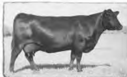
SAV EMBLYNETTE 7319

The productive dam of SAV 004 Predominant 4438 who records a weaning ratio of 113 on three calves and owns the eighth highest weaning EPD among all current dams of the angus breed.