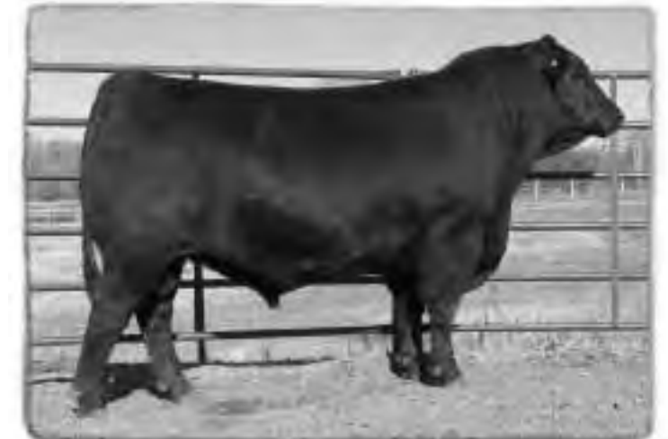
PEAK DOT PRIME CUT 150S LOT 38

MALE PDAR 150S 1337560 March 21 2006 SUMMITCREST PRIME CUT 1G42 FINKS 5522-6148 BASIN PRIME CUT 354K SUMMITCREST BARBARA 0874 BASIN HEIRESS 353 BASIN E Z BASIN HEIRESS 7240 DOUBLE AA RITO 261'97 JOHNSTON 2100 BARDOLENE 554Y DOUBLE AA LADY 76'01 DOUBLE AA ANNIE K 87'91 DOUBLE AA LADY 26'96 DOUBLE AA BLACKMAN 24'93 DOUBLE AA LADY 10'93 BW: 87 lbs. Adj. 205D: 754 lbs. Adj. 365D: 1326 lbs. YG: +18 BW: +3.4 WW: +31 YW: +48 Milk: +14 Mat: +30