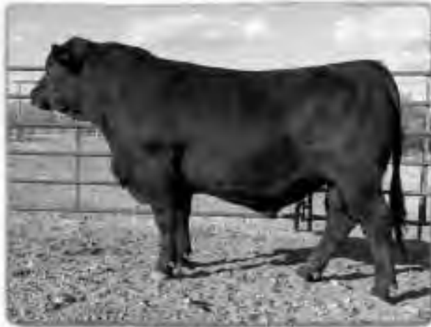
PEAK DOT PREDOMINANT 108S LOT 4