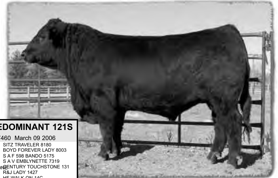
PEAK DOT PREDOMINANT 121S LOT 18

MALE PDAR 121S 1337460 March 09 2006 S A V 8180 TRAVELER 004 SITZ TRAVELER 8180 S A V 004 PREDOMINANT 4438 BOYD FOREVER LADY 8003 S A F 598 BANDO 5175 S A V EMBLYNETTE 1182 S A V EMBLYNETTE 7319 CHAMPION HILL GENERAL STONE CENTURY TOUCHSTONE 131 MIA OF PEAK DOT 905H R&J LADY 1427 MIA OF PEAK DOT 539E HF WALK-ON 14C MIA OF PEAK DOT 604Z BW: 83 lbs. Adj. 205D: 705 lbs. Adj. 365D: 1206 lbs. YG: +25 BW: +3.2 WW: +39 YW: +63 Milk: +20 Mat: +40