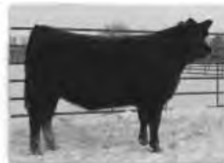
SUSIE OF PEAK DOT 523R Full sister to lot 54

MALE PDAR 171S 1337464 March 08 2006 STEVENSON BRUNO 561G STEVENSON ROYCE 741C STEVENSON BRUNO 6371 JRS ENCHANTRESS 16A STEVENSON QUEEN 828F BASIN RAINMAKER 2844 STEVENSON QUEEN 217C PEAK DOT STOCKMAN 12F 2TM STOCKMANS OSCAR 210 SUSIE OF PEAK DOT 914H PRINCESS OF PEAK DOT 209B CEDAR CREEK LADY 125E FREYS EXTRA PROFIT LADY CEDAR CREEK 125Z BW: 91 lbs. Adj. 205D: 632 lbs. Adj. 365D: 1145 lbs. YG +23 BW: +4.2 WW: +20 YW: +43 Milk: +20 Mat: +30