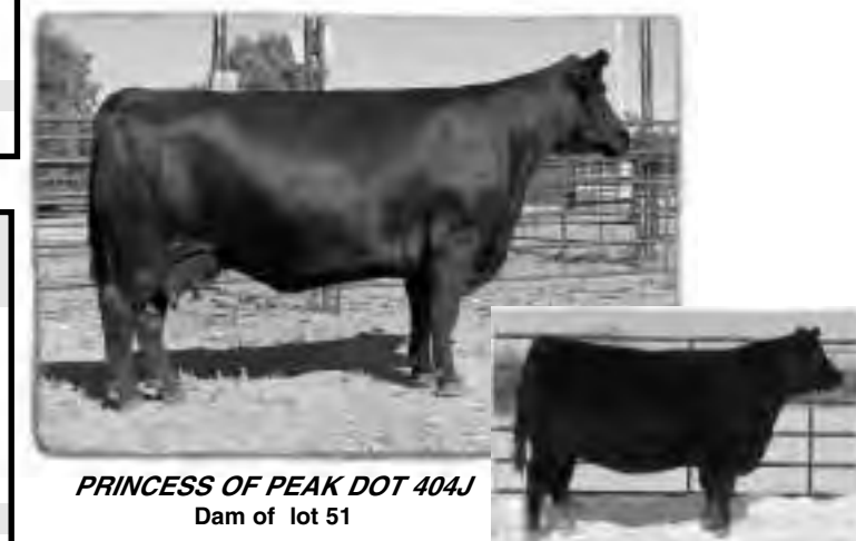
PRINCESS OF PEAK DOT 404J Dam of lot 51