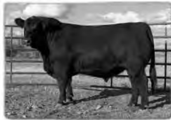
PEAK DOT PREDOMINANT 98S LOT 7