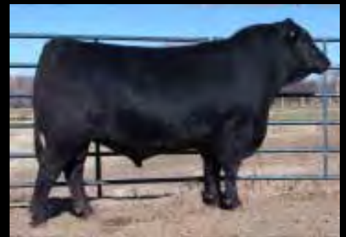
Peak Dot Prime Cut 150S - Lot 38