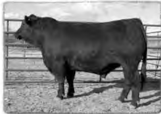
PEAK DOT PREDOMINANT 142S LOT 6