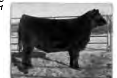
QUEEN OF PEAK DOT 657S flush sister to Lot 21