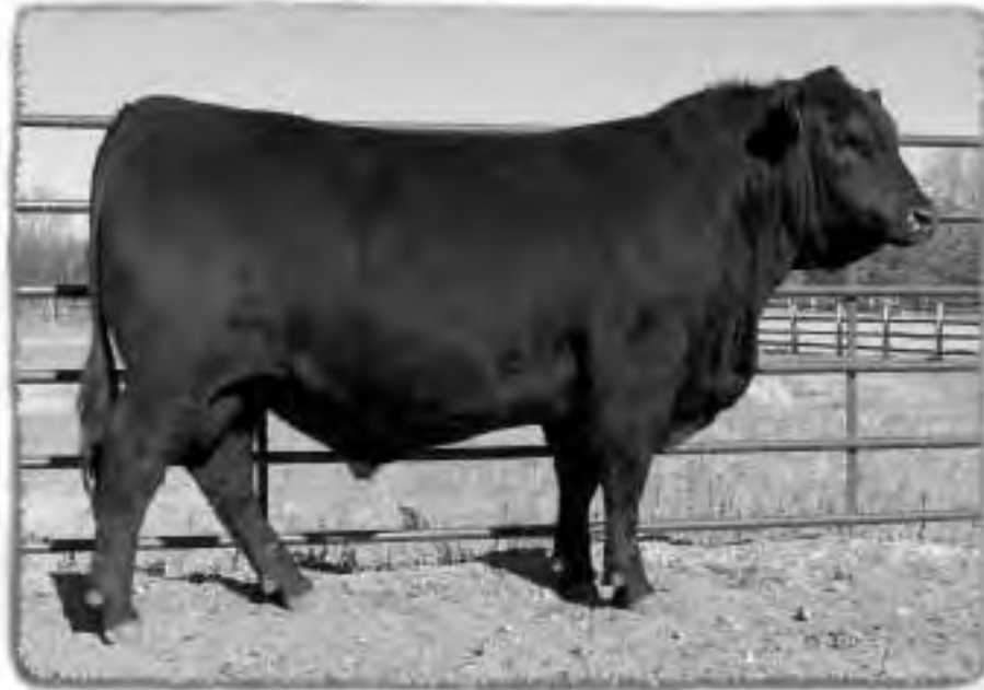
PEAK DOT PREDOMINANT 661S LOT 17

A long fronted Predominant son with a powerful hip that is sure to add some stretch and pounds to his calves. His Hobson dam is an embryo donor that is solid black with an excellent udder. His flush sister, Heroine of Peak Dot 666S was featured in the spring sale and his flush brother sells as lot 3.