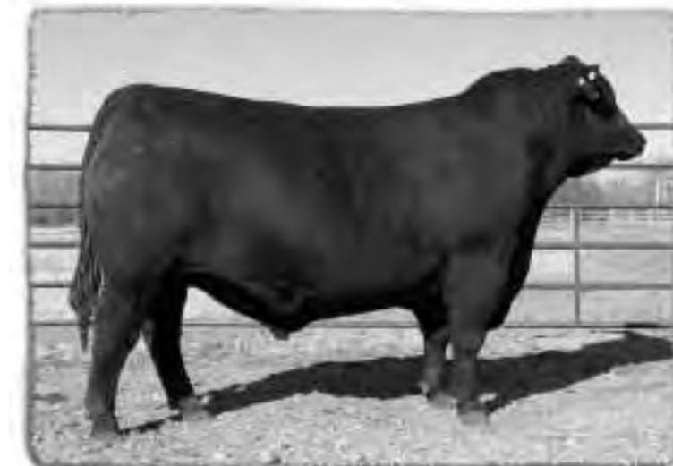
PEAK DOT PREDOMINANT 124S LOT 2

As correct and and free moving as they come, Lot 1 is a near replica of his sire. He posted strong performance numbers across the board and come equipped with an excellent set of testicles.