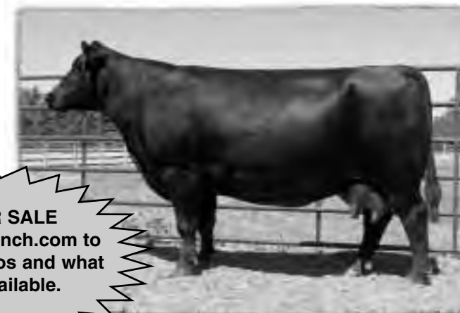
Donor cow Bardolia of Peak Dot 963H

EMBRYOS FOR SALE visit www.peakdotranch.com to see donor cow photos and what embryos are available.