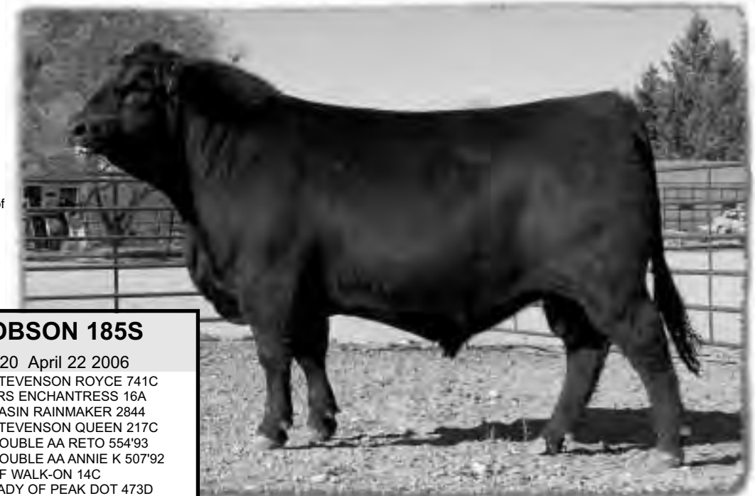
PEAK DOT HOBSON 185S - LOT 55

MALE PDAR 185S 1360020 April 22 2006 STEVENSON BRUNO 561G STEVENSON ROYCE 741C STEVENSON BRUNO 6371 JRS ENCHANTRESS 16A STEVENSON QUEEN 828F BASIN RAINMAKER 2844 STEVENSON QUEEN 217C DOUBLE AA RITO 287'97 DOUBLE AA RETO 554'93 LADY OF PEAK DOT 575K DOUBLE AA ANNIE K 507'92 LADY OF PEAK DOT 764G HF WALK-ON 14C LADY OF PEAK DOT 473D BW: 82 lbs. Adj. 205D: 785 lbs. Adj. 365D: 1300 lbs. YG: +30 BW: +3.3 WW: +44 YW: +74 Milk: +25 Mat: +46