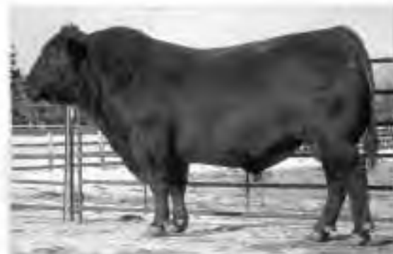
SAR Fame 2089 Sire of lot 84

MALE PDAR 201S 1337726 May 10 2006 RIVERBEND POWERLINE 0050 CONNEALY FRONTLINE KDF POWERLINE 28N LEACHMAN BLACKBIRD 8060 LADY BONNIE OF K DEEN KY 75K NEEDMORE PRIDE TRAVELLER 2F DYNALADYLYN OF NEEDMORE 24D PEAK DOT PANAMA 121G O S U PANAMA 4178 QUEENMOTHER OF PEAKDOT 787P LADY OF PEAK DOT 346C QUEENMOTHER OF PEAKDOT 449D 2TM STOCKMANS OSCAR 210 MIA OF PEAK DOT 251R BW: 77 lbs. Adj. 205D: 741 lbs. Adj. 365D: 1415 lbs. Y G: +22 BW: +3.2 WW: +31 YW: +52 Milk: +14 Mat: +29