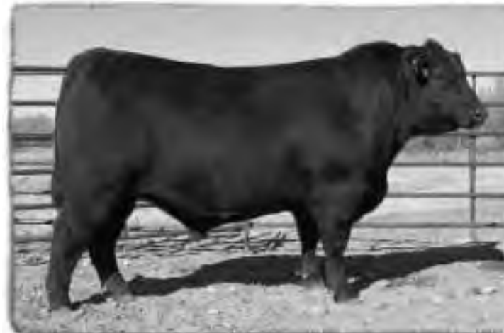
PEAK DOT NEW TREND 1S LOT 35

MALE PDAR 1S 1337654 January 28 2006 L F NEW TREND 4100 V D A R NEW TREND 784 S A R NEW TREND 4100 2080 LAZY FOUR LUCY 003 CHAMPION HILL POCAHONTAS RITO 3W3 OF OJ2 RITO 9FB3 WAR SARA 0209 7142 BASIN PRIME CUT 354K SUMMITCREST PRIM CUT 1G42 BARBARA OF PEAK DOT 435N BASIN HEIRESS 353 LADY OF PEAK DOT 521K DOUBLE AA RITO 287'97 LADY OF PEAK DOT 555E BW: 90 lbs. Adj. 205D: 757 lbs. Adj. 365D: 1239 lbs. YG: +29 BW: +4.8 WW: +38 YW: +67 Milk: +16 Mat: +35