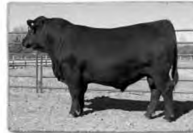
PEAK DOT PREDOMINANT 138S LOT 9

A bull with excellent scrotal development and a gentle disposition. His two year old dam is one of the most impressive cows in the Peak Dot herd. His two flush sisters pictured to the left were features in the spring sale and were among the top selling lots.