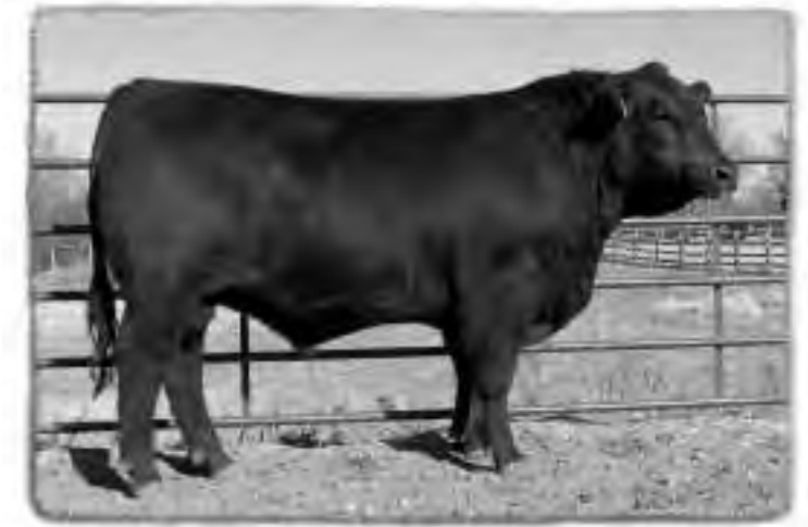
PEAK DOT PRIME CUT 77S LOT 39

MALE PDAR 77S 1337735 February 22 2006 SUMMITCREST PRIME CUT 1G42 FINKS 5522-6148 BASIN PRIME CUT 354K SUMMITCREST BARBARA 0874 BASIN HEIRESS 353 BASIN E Z BASIN HEIRESS 7240 STEVENSON BRUNO 6371 STEVENSON BRUNO 561G JESSICA OF PEAK DOT 815P STEVENSON QUEEN 828F JESSICA OF PEAK DOT 794L PEAK DOT RANSOM 152H JESSICA OF PEAK DOT 549E BW: 80 lbs. Adj. 205D: 727 lbs. Adj. 365D: 1382 lbs. YG: +28 BW: +2.4 WW: +33 YW: +61 Milk: +18 Mat: +35