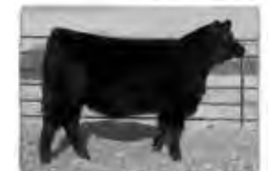
QUEEN OF PEAK DOT 650S flush sister to Lot 21