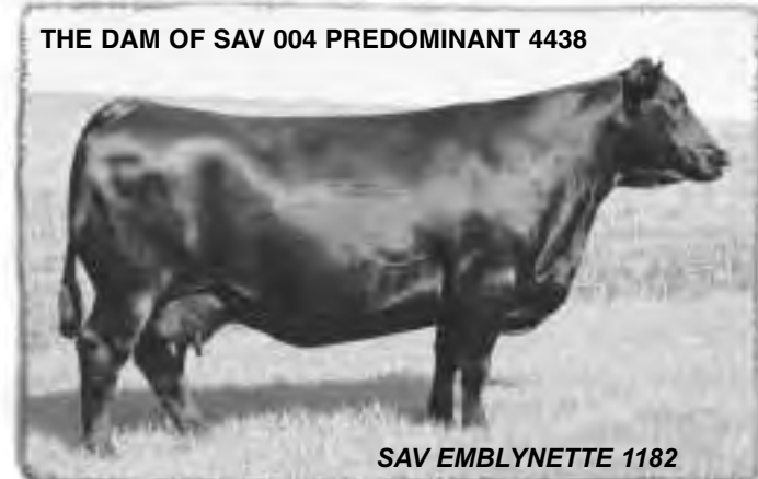
SAV EMBLYNETTE 1182

The productive dam of SAV 004 Predominant 4438 who records a weaning ratio of 113 on three calves and owns the eighth highest weaning EPD among all current dams of the angus breed.