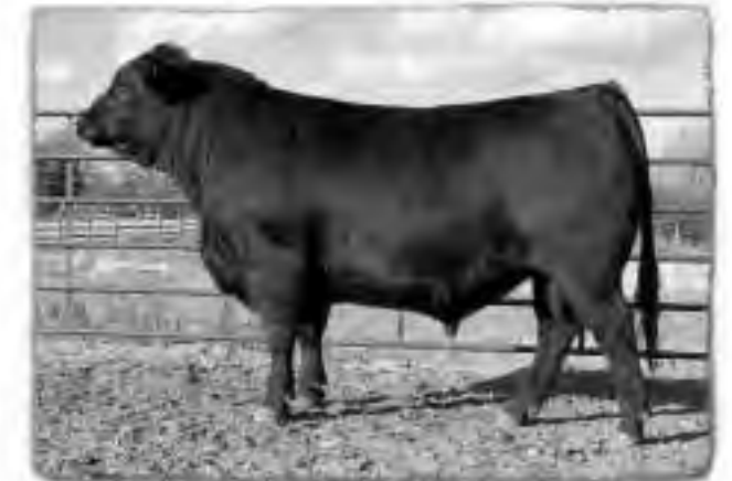
PEAK DOT PREDOMINANT 139S LOT 11

A pair of Predominant sons that were born March 16, both bulls had 84lb birth weights, with yearling weights over 1300lbs. They are very similar to the stamp Predominant puts on all his progeny, with their proud fronts, excellent feet, full girths and wide tops.