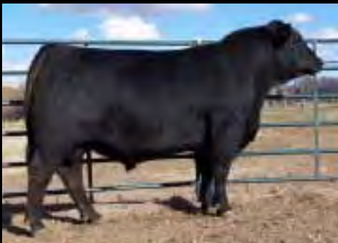
Peak Dot Predominant 115S - Lot 1