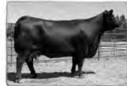
HEROINE OF PEAK DOT 721P Dam of Lot 17