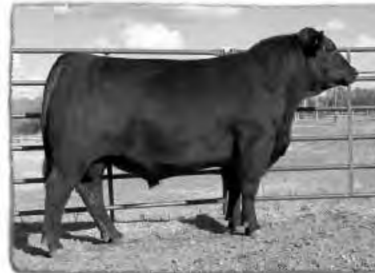
PEAK DOT PREDOMINANT 115S LOT 1

This prolific Pathfinder cow is the grand dam of SAV 004 Predominant 4438, she records a weaning ratio of 110 on 5 calves.