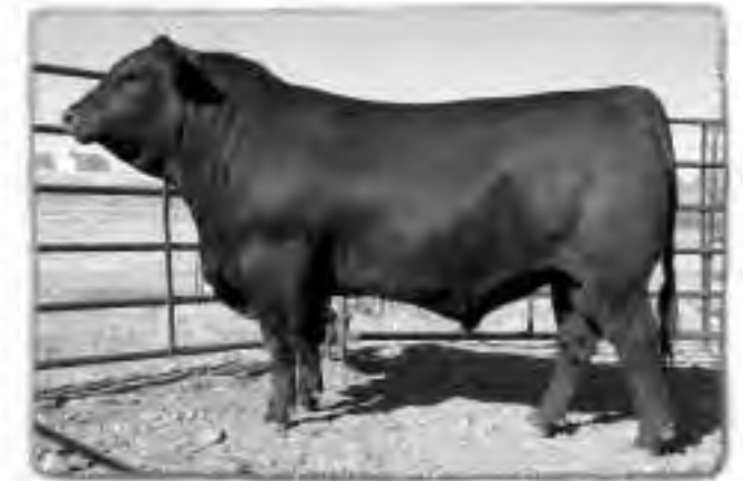
PEAK DOT PREDOMINANT 656S LOT 8

A bull with excellent scrotal development and a gentle disposition. His two year old dam is one of the most impressive cows in the Peak Dot herd. His two flush sisters pictured to the left were features in the spring sale and were among the top selling lots.