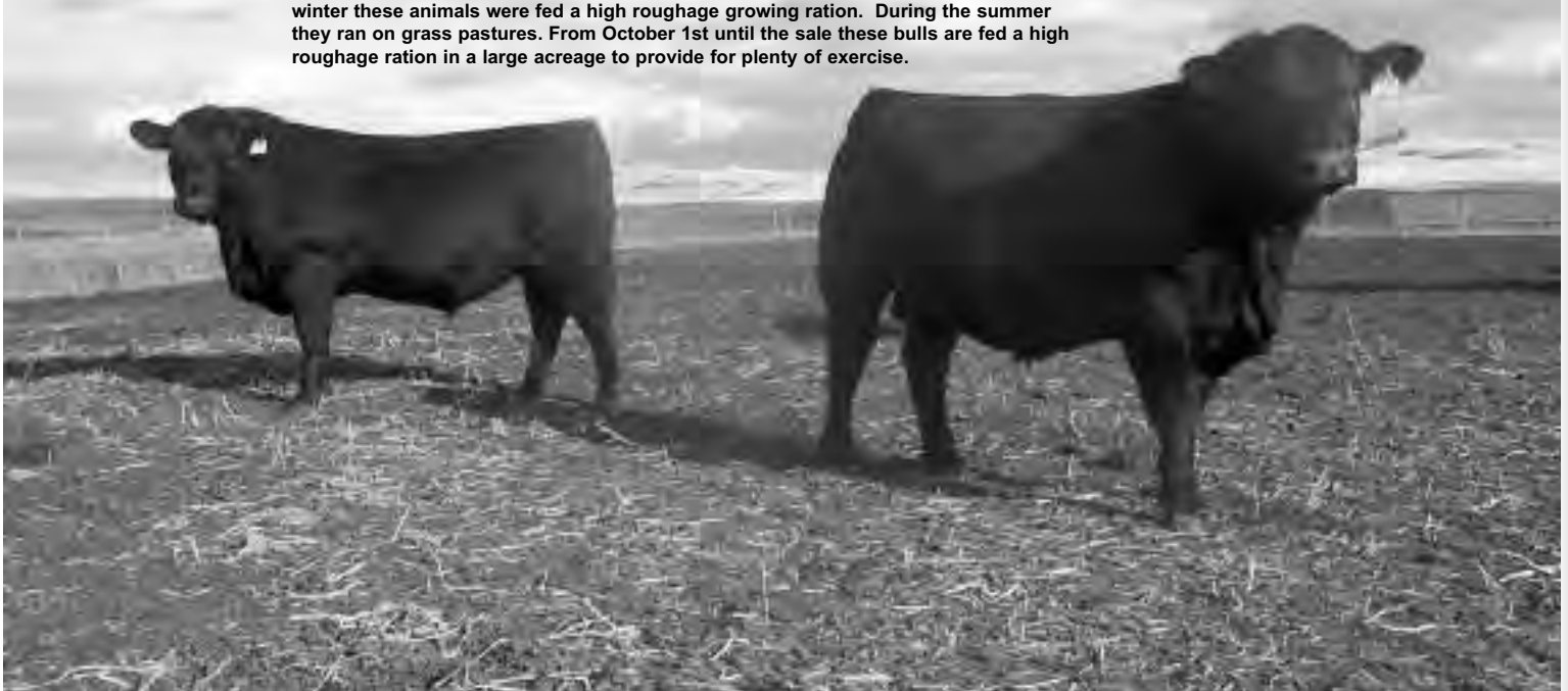
These coming 2 year old virgin bulls were selected last spring for the fall sale. These bulls were raised from birth to weaning without creep. From weaning through the winter these animals were fed a high roughage growing ration. During the summer they ran on grass pastures. From October 1st until the sale these bulls are fed a high roughage ration in a large acreage to provide for plenty of exercise.