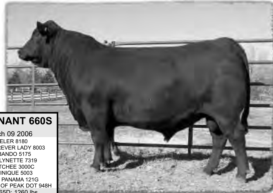
PEAK DOT PREDOMINANT 660S LOT 22

A premier calving ease bull by Predominant out of a full bodied fancy Saugahatchee cow. Dam Duchess of Peak Dot 654N is an embryo donor at Peak Dot.