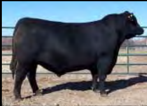
Peak Dot Predominant 124S - Lot 2