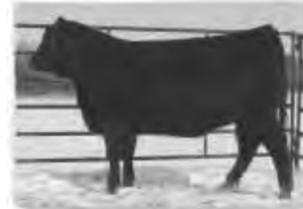
Heather of Peak Dot 437R full sister to lot 71

HF Power-Up was the 2003 Sr. bull calf champion at Agribition 2003, and the Agribition Grand Champion in 2005. He caught the attention of cattlemen when he highlighted the 2003 Hamilton Farms sale where he was admired for his awesome performance and his massive volume and muscle. He holds EPDs in the top 10% for weaning weight and yearling weight, and stands in the top 15% of the breed for milk. His PAPA Equator 2928 dam is picture perfect with a strong production record.