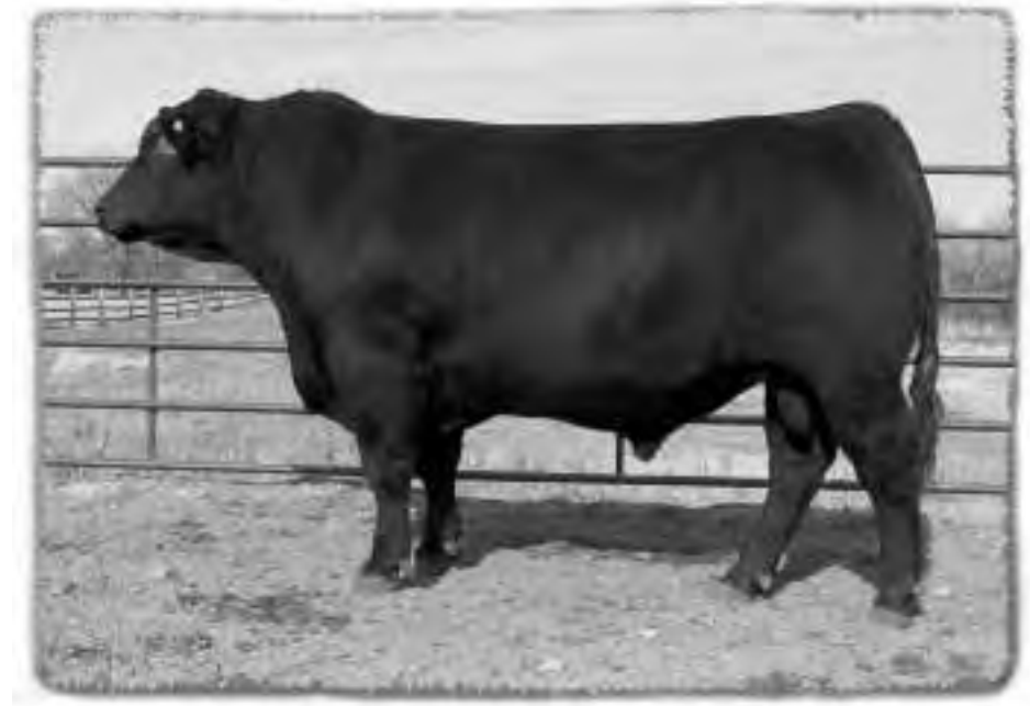
PEAK DOT POWERLINE 26S - LOT 71

A performance powerhouse who posted a 205 day weight of 847lbs. His full sister was a feature lot and the heaviest heifer in the 2006 sale. His dam has frozen several eggs and will be a cornerstone in the Peak Dot program.