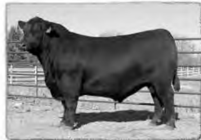
PEAK DOT PREDOMINANT 107S LOT 5