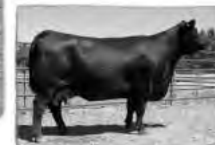
HEROINE OF PEAK DOT 721P

BW: 81 lbs. Adj. 205D: 762 lbs. Adj. 365D: 1300 lbs. Y G: +30 BW: +2.4 WW: +42 YW: +71 Milk: +25 Mat: +46