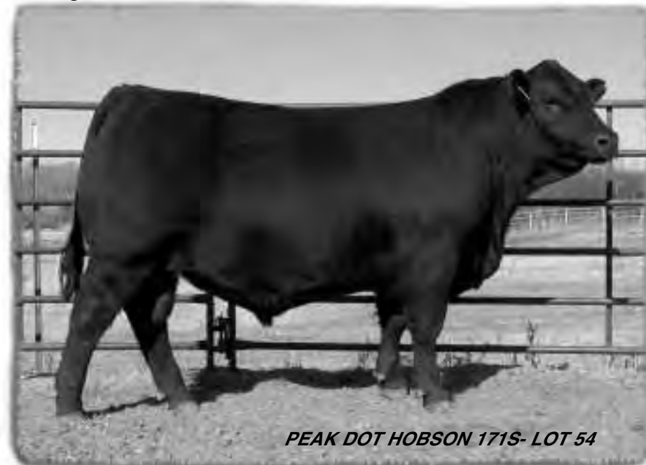
PEAK DOT HOBSON 171S- LOT 54

Hobson was the lot 1 bull and high selling bull out of the Stevenson-Basin 2001 sale to Peak Dot Ranch for $16000(U.S.). He was the second highest actual weaning weight calf at Stevenson-Basin Ranch. He ranks in the top 1% for milk EPD. If you are looking to put some power, performance and punch into your herd while improving maternal traits, and scrotal size, Hobson hits the target.