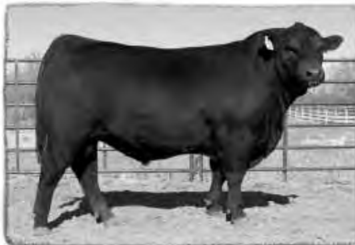
PEAK DOT NEW TREND 51S LOT 36

MALE (TW) PDAR 51S 1337502 February 11 2006 L F NEW TREND 4100 V D A R NEW TREND 784 S A R NEW TREND 4100 2080 LAZY FOUR LUCY 003 CHAMPION HILL POCAHONTAS RITO 3W3 OF OJ2 RITO 9FB3 WAR SARA 0209 7142 DOUBLE AA BARDOLIER 3'97 DOUBLE AA BARDOLIER 15'90 LADY OF PEAK DOT 386J DOUBLE AA ANNIE K 501'91 LADY OF PEAK DOT 242B PEAK DOT RANCHERO 405Y LADY OF PEAK DOT 223R BW: 79 lbs. Adj. 205D: 730 lbs. Adj. 365D: 1298 lbs. YG: +31 BW: +3.4 WW: +34 YW: +64 Milk: +18 Mat: +34