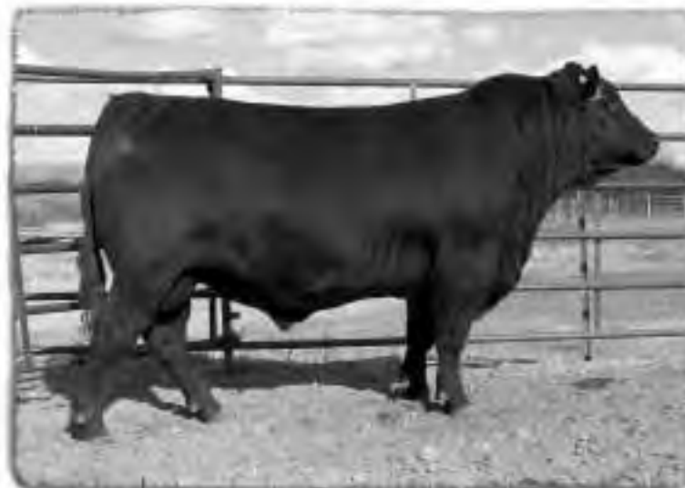
PEAK DOT PREDOMINANT 664S LOT 3

A calving ease bull out of a well proven cow family. Dam Mia of Peak Dot 283M was one of the top selling lots in last years female sale. Granddam Mia of Peak Dot 316J and great granddam Mia of Peak Dot 706G both serve as embryo donors at Peak Dot.