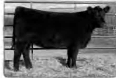
HEROINE OF PEAK DOT 666S flush sister to Lot 17

A long fronted Predominant son with a powerful hip that is sure to add some stretch and pounds to his calves. His Hobson dam is an embryo donor that is solid black with an excellent udder. His flush sister, Heroine of Peak Dot 666S was featured in the spring sale and his flush brother sells as lot 3.