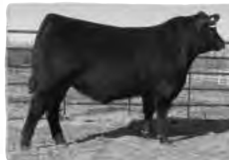
PEAK DOT HOBSON 142P Full brother to lot 54

Out of a great cow Susie of Peak Dot 914H. A rock solid moderate framed son of Hobson that is loaded with raw muscle and substance. His full brother was the high selling bull in the 2005 sale to Ring Creek Farm for $13500. His full sister was featured in the 2006 sale and was purchased by Ring Creek Farm.